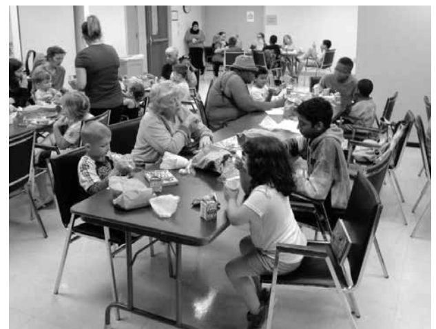
Lunch is served... filling more than just tummies at The Library!

The Library joined forces with Dauphin County Technical School and the Central PA Food Bank to provide children ages 18 and under with free nutritious lunches throughout the summer. 3,844 children came to The Library and enjoyed a free lunch as part of the Summer Feeding Program. On some days, during lunch, children were also treated to an impromptu library program. The staff at The Library look forward to being able to offer this program once again next summer.