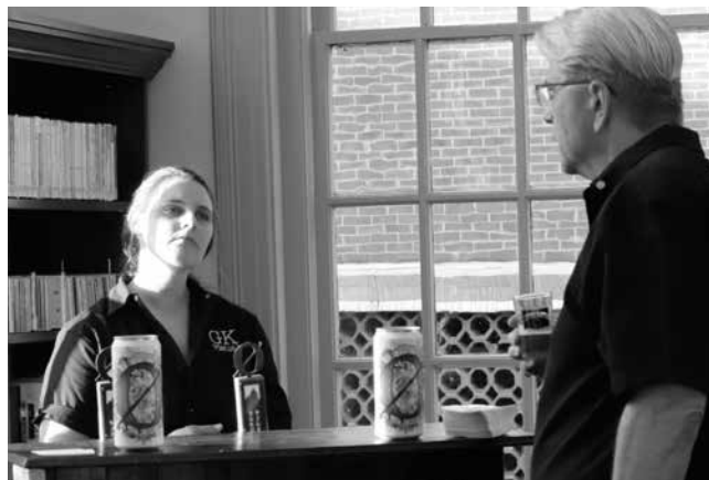
Sipping about the stacks with Harrisburg's Zeroday Brewing Co.