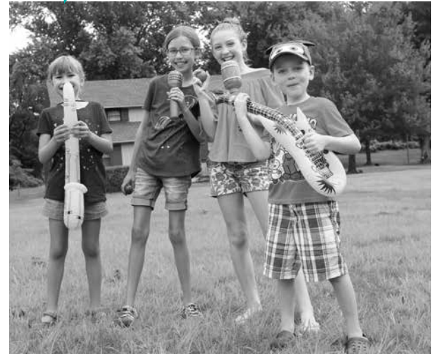
Bringing the magic to a rocking, rolling, reading-filled summer celebration!

Those are some stellar achievements. Our thanks to all who participated and to our sponsors and supporters who made it all possible.